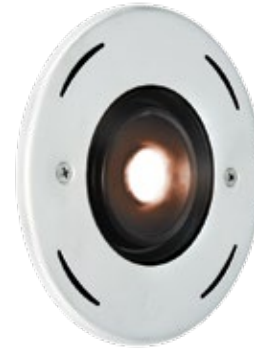
LS333ANS-2LED Swimming Pool

Any luminaire can become hot - take care with appropriate use and placement