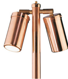
LS192-2A Double Grevillea