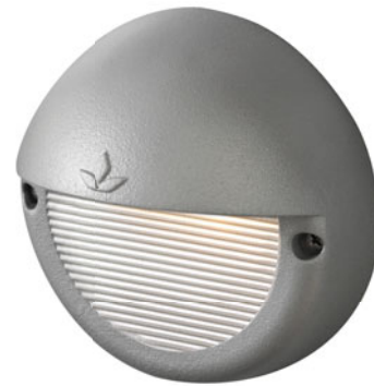
LS371 Boulevard Silver, powder coated

Any luminaire can become hot - take care with appropriate use and placement