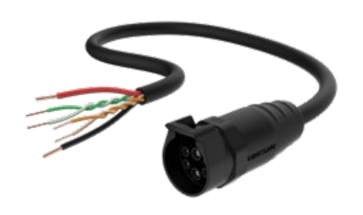
Leader Cable Powersync™ Extra Low Voltage 16AWG (1.5mm²) + Data - LS6445