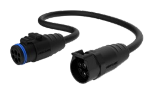
Jumper Cable Powersync™ Extra Low Voltage 16AWG (1.5mm²) + Data - LS6446